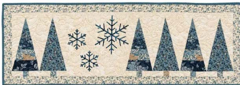
The next block in our Quilt-Along is "Pine Tree" from page 110 in our "Patches of Blue" book.