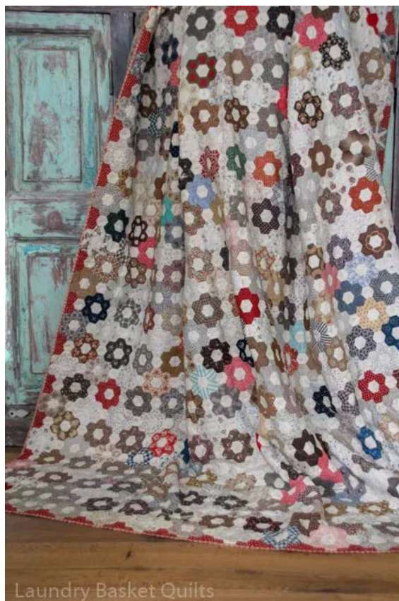
Grandmother's Garden is one of the many quilts that reflect botanical beauty.

And speaking of nature, many times she can be found in our quilts.